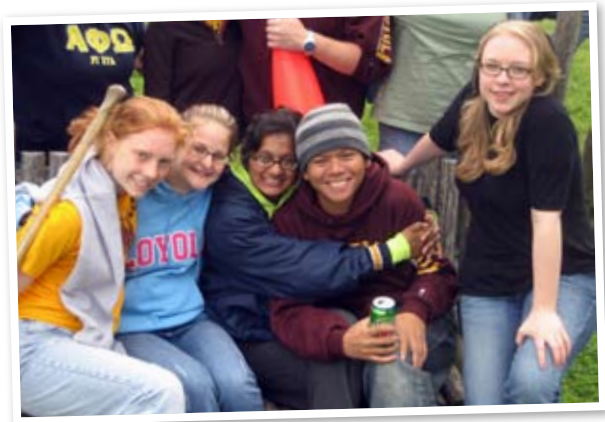
Students attending Evoke Jam III, a campus-wide celebration of calling.