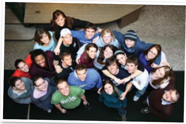
First-year students take time out to reflect on their gifts and passions on the Explore! Retreat.